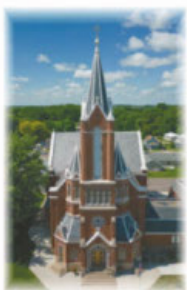
Church of St. Anthony Yesterday • Today • For Eternity

We have now raised 23% of our goal, or nearly $252,000 in financial commitments to help us repair the exterior and renovate the interior of our historic church. This leaves us with $852,000 to raise and collect in funds over the next three years.