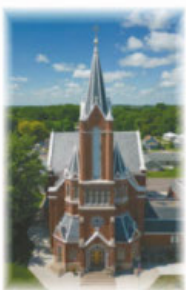
Church of St. Anthony Yesterday • Today • For Eternity

Thank you to those who have picked up their personalized folder and who have returned their decision to help us repair the exterior and renovate the interior of our historic church.