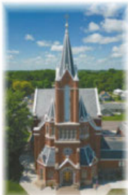
Church of St. Anthony Yesterday • Today • For Eternity

• Our first priority is to complete the exterior repairs on the church as soon as next year to prevent any possible damage to the structure, and the resulting potential for higher costs. To accomplish that we need your financial commitment and the resulting contributions.