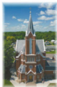
Church of St. Anthony Yesterday • Today • For Eternity