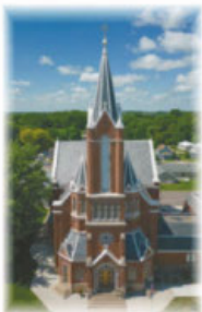
Church of St. Anthony Yesterday • Today • For Eternity

Thank you to those parishioners who joined us for one of the brief Circles of Support gatherings to pick up your folder and listen to the brief presentation. We appreciate your participation!