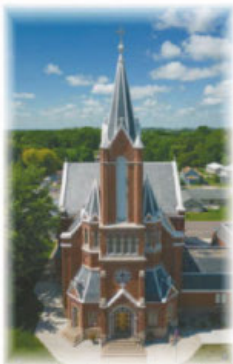
Church of St. Anthony Yesterday • Today • For Eternity