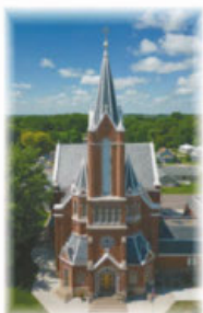
Church of St. Anthony Yesterday • Today • For Eternity

Due to the production schedule for holiday bulletins, this message was written on December 15. Therefore, please watch for an update on our campaign results next weekend. Thank you.